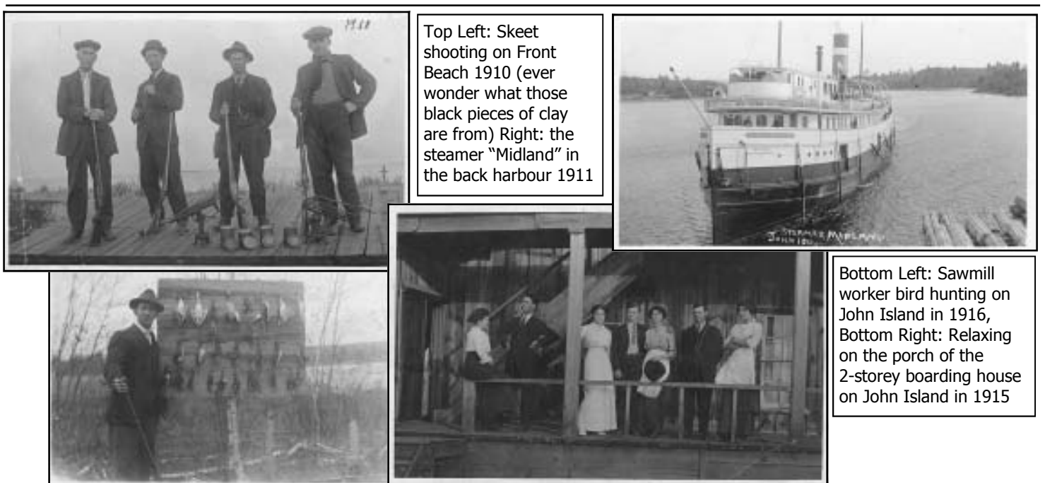
Top Left: Skeet shooting on Front Beach 1910 (ever wonder what those black pieces of clay are from) Right: the steamer "Midland" in the back harbour 1911