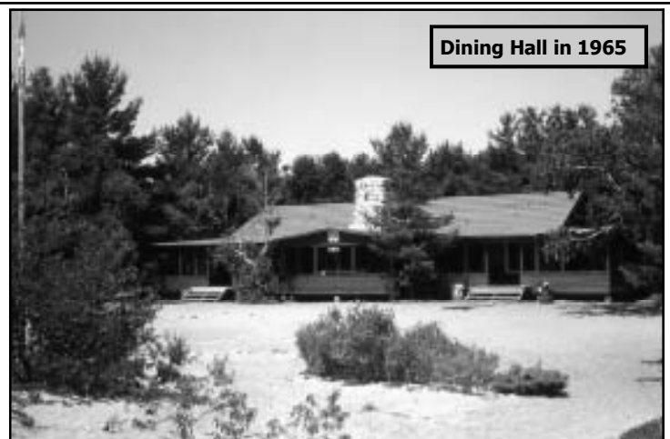
Dining Hall in 1965