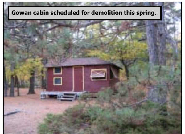
Gowan cabin scheduled for demolition this spring.

There will be a John Island Camp Redevelopment Campaign "Donor Appreciation Night" on Friday May 29th at the YMCA in Sudbury. The evening reception will recognize our donors, showcase our accomplishments and thank those who have worked on the campaign. On Saturday May 30th donors are invited to John Island for a day of island fun, and to show off the work done to date. Invitations will be mailed shortly to donors - but please mark these dates on your calendar today.