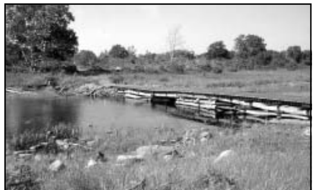
Left: Ironsides - 1972 - the original Ironsides was widened and lengthened by six feet in the years after this photo Right: the original bridge - over the Kwai in 1965 - notice the lack of trees and undergrowth on the shoreline, replaced and raised years later